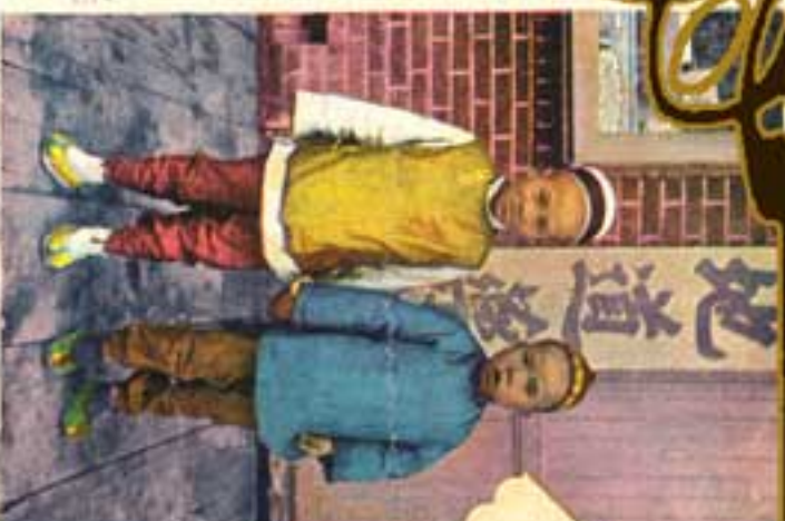
PO AND WIND IN CHINA-TOWN.

All the children from the school in Angeles are sending them as a mission among them