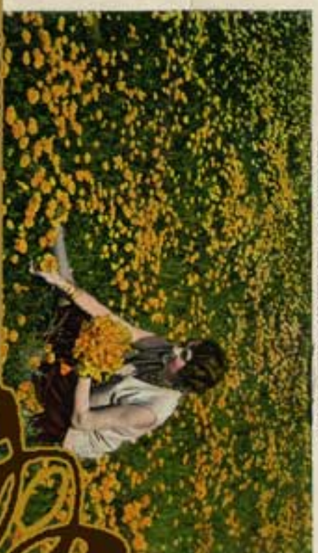
EXHIBITION PAPER FOLD-NEED FOR ANGELES, CALIFORNIA

A Sweet Orange Tree in Southern California. Dear Mother - Just have some fruit ready to get the boys with the new year's money the 1st of Jan. the 1st of Jan. the 1st of Jan.